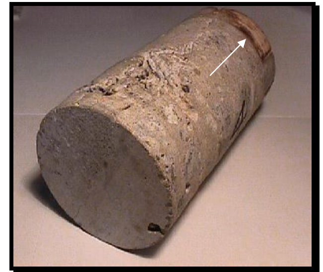
Imbedded Form Wood